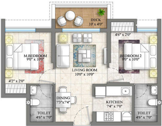
TYPICAL UNIT PLAN - 2 BHK WITH DECK